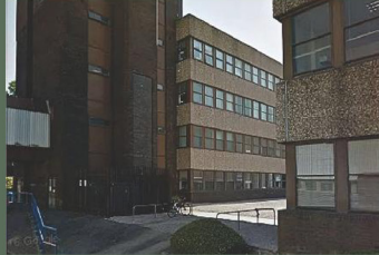
After: Proposed Bridge Link