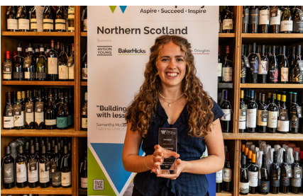
Northern Scotland Student Awards Summer Drinks – May

WiP Northern Scotland recently hosted successful netwalking events as part of its wellbeing and networking programme. In Aberdeen, members and guests enjoyed a summer walk at Hazlehead Park, while in Tayside participants took part in a scenic stroll along the River Tay. Both events offered a valuable opportunity to step away from the desk, enjoy fresh air, and connect with local members in an informal setting. Thank you to everyone who joined us, with more netwalks planned throughout the year.