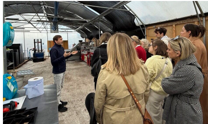
Crop Innovation Centre (CIC), The James Hutton Institute Visit – March 2026