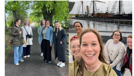
Netwalking (Aberdeen and Dundee) – May 2026

We hosted a return visit to the newly completed Crop Innovation Centre at the James Hutton Institute in Invergowrie. Members enjoyed a guided tour of state-of-the-art facilities, showcasing plant science research through the Advanced Plant Growth Centre and International Barley Hub. The visit highlighted innovations in phenotyping and vertical farming, and how the centre supports crop science, food resilience and sustainable agriculture. Thank you to all involved in hosting this insightful visit.