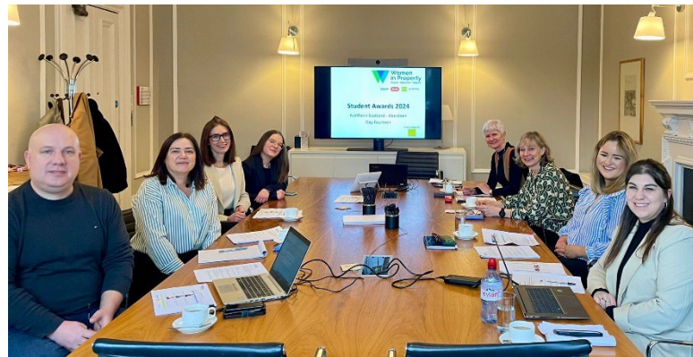
Northern Scotland Judging Day

More on the Northern Scotland Student Awards Event in the next issue, including an announcement of the winner!