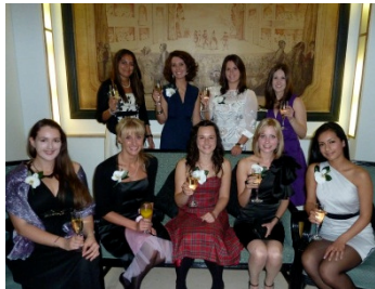
The Award Finalists