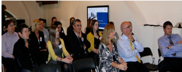
Audience at the Event