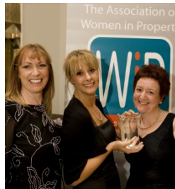
The Winner (center)